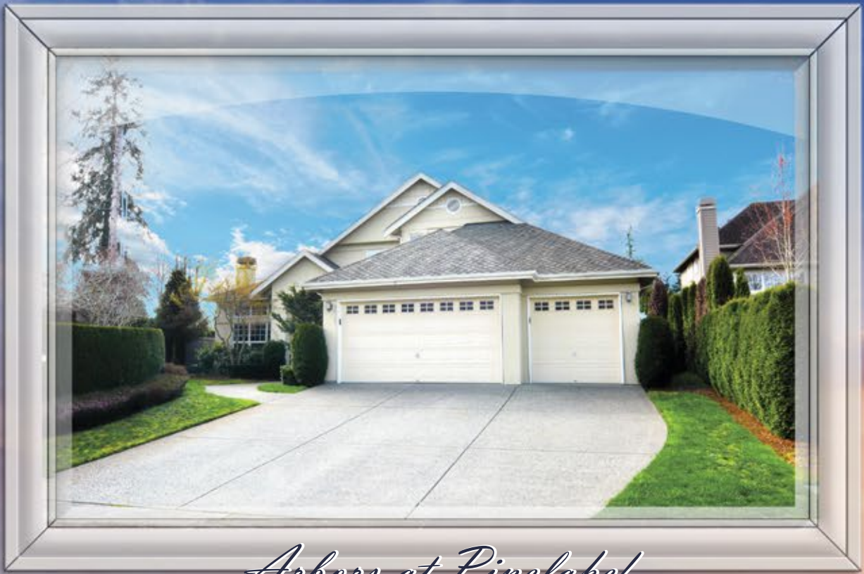
Arbors at Pinelake!