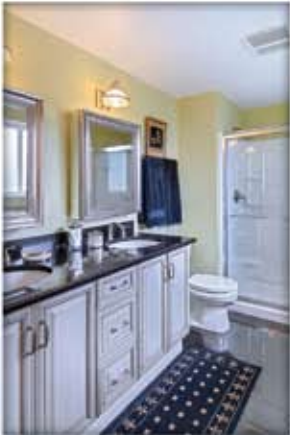
New Master Bath!