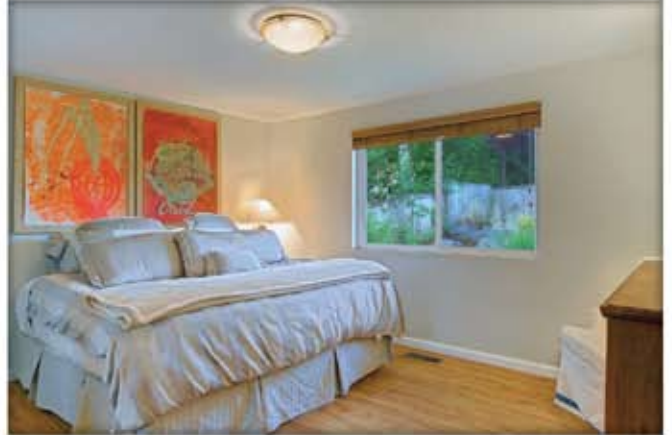
Master looks out to water feature!