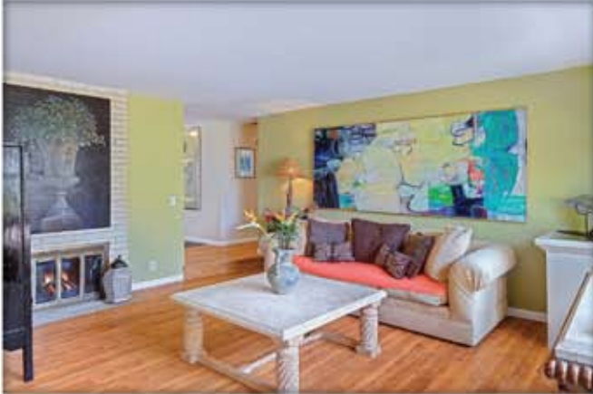
Enjoy the warmth and the style!