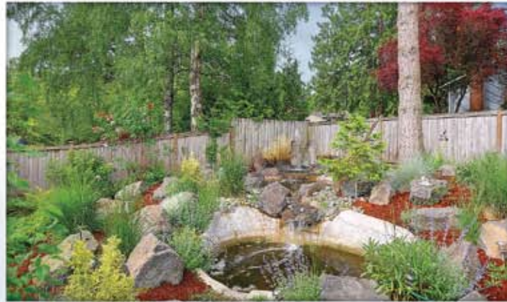
Wonderful water feature and naturalistic landscaping!