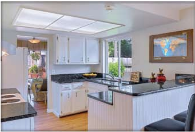
New granite counters in the kitchen!