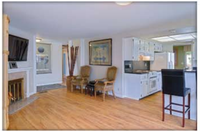
New flooring throughout!