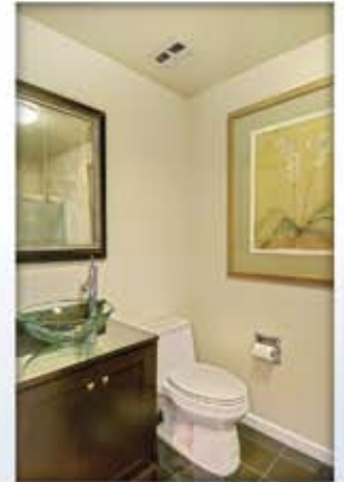
New Hall Bath!