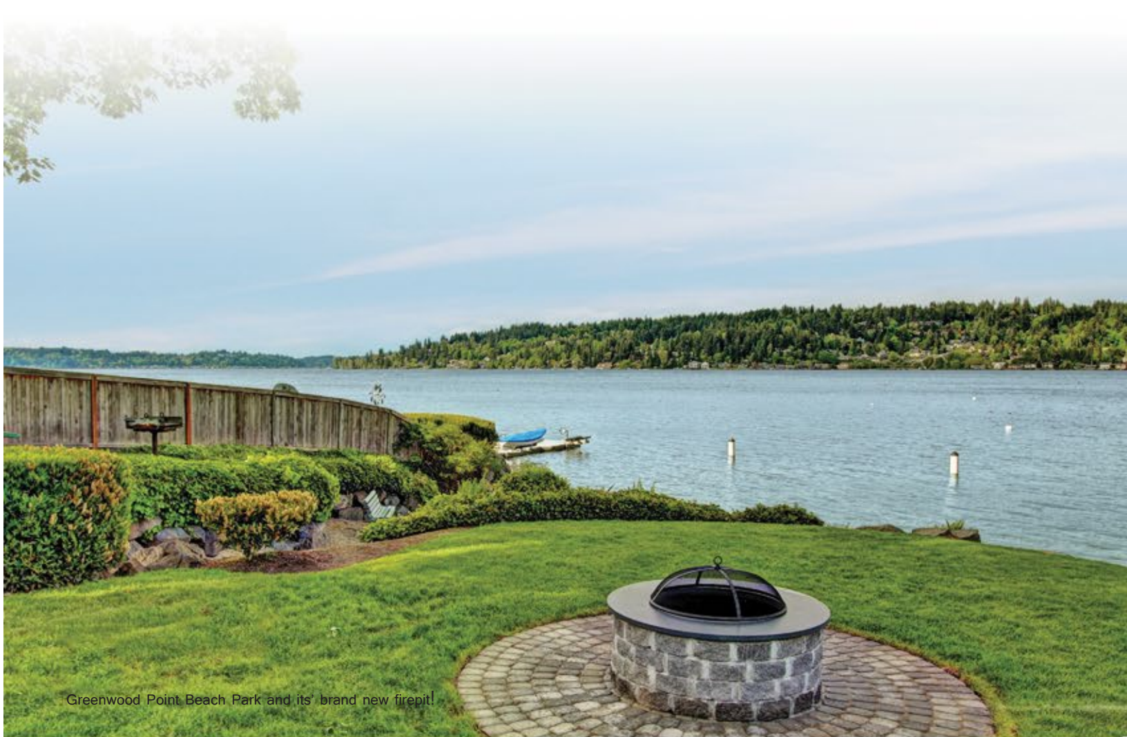
Greenwood Point Beach Park and its' brand new firepit!

Year Built 1978 Taxes 2013: $5,293 HOA Dues: $200/year