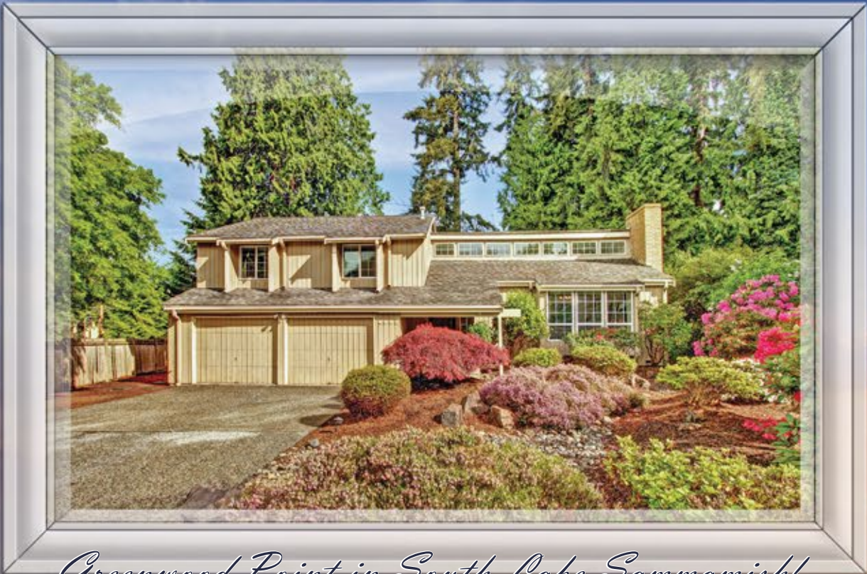
Greenwood Point in South Lake Sammamish!