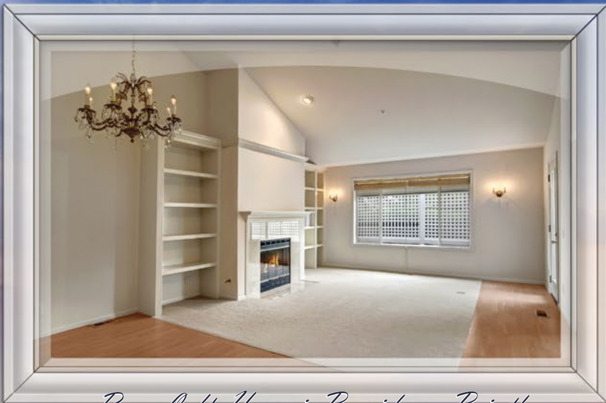
Rare Loft Home in Providence Point!