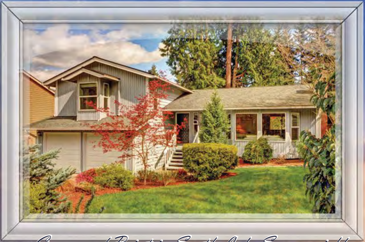
Greenwood Point in South Lake Sammamish!