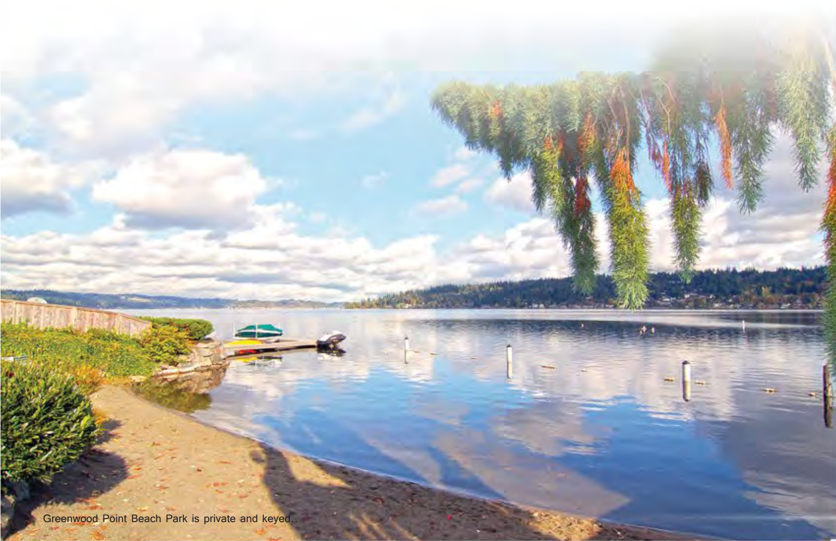
Greenwood Point Beach Park is private and keyed..