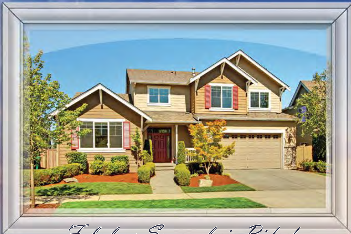
Fabulous Snoqualmie Ridge!