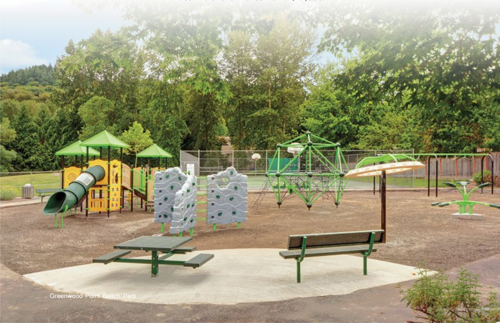
Greenwood Point Beach Park